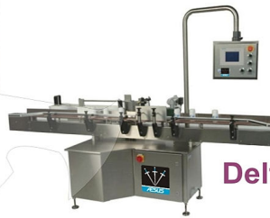
Delta PS Labelers