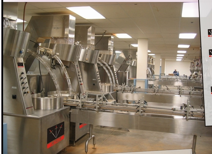
High Speed Unscramblers feed the lines