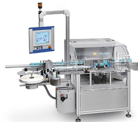
Premier PS Labelers