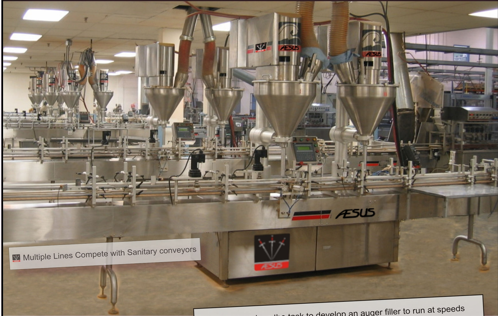
Multiple Lines Compete with Sanitary conveyors