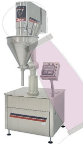
Single Head Extreme Speed Auger fillers