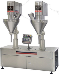
Twin Head Extreme Speed Auger fillers